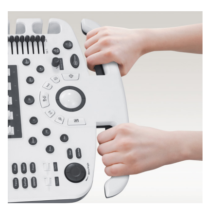
Lift-able control panel