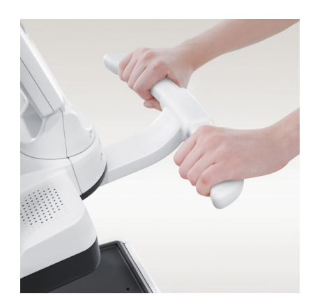
Front and rear handles