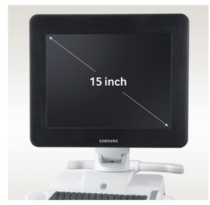
15-inch LED monitor

The SONOACE R5 is designed to provide you not only the diagnostic functions, but also the great user convenience. Ergonomic design, improved user interface and the quality of its everyday functions, such as QuickScan<sup>™</sup>, FSI<sup>™</sup>, and THI, will enable you to extend your diagnostic boundaries while enjoying a more comfortable working environment.