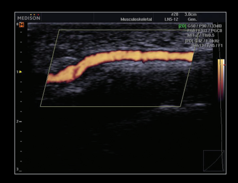
Hand with power Doppler

Practical, efficient, comfortable diagnosis